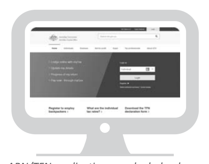
ABN/TFN applications can be lodged online through the ATO portal.

An ABN/TFN is required for the SMSF. The application for the ABN/TFN includes registering as an ATO regulated fund. The application needs to be submitted to the ATO within 60 days of executing the trust deed. These registrations are required to allow contributions/rollovers to the SMSF.